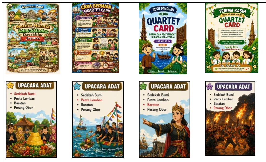
Picture 3. Final product image

The improvement of the media quartet card is carried out based on suggestions and inputs from material experts and media experts. Improvements include enlarging the size of the writing to make it easier for students to read, improving color combinations to make the media appearance more attractive, and replacing some images to better suit the material of norms and customs in my area. In addition, the content of the material on the card is simplified to make it easier for elementary school students to understand. The researcher also added instructions on how to play and a manual on the use of media to make it easier for teachers and students to use media quartet cards during the learning process.